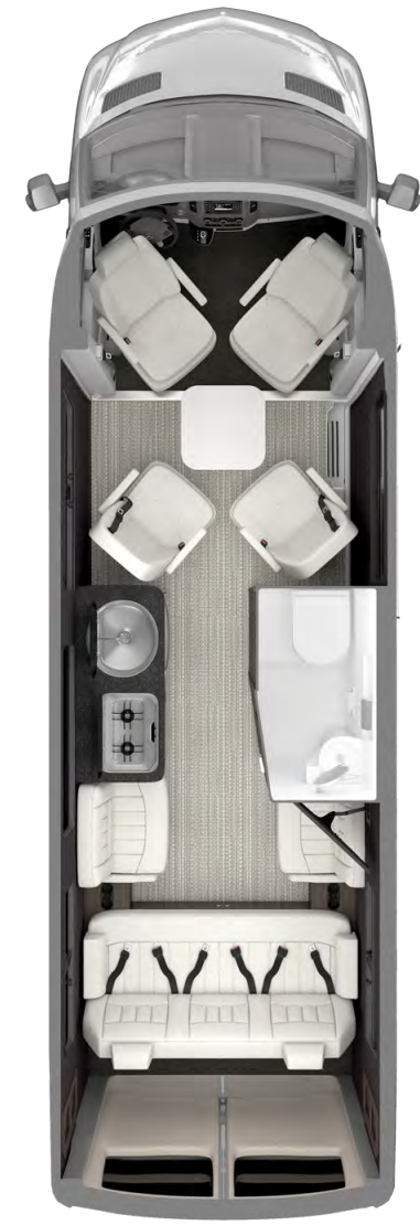
Interstate 24GL 4x4