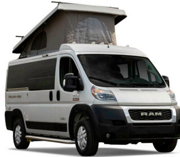
Bright Silver Metallic