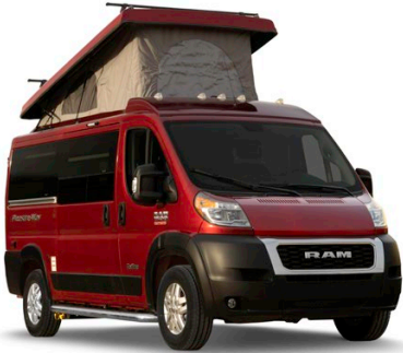
Deep Cherry Red Crystal Pearl