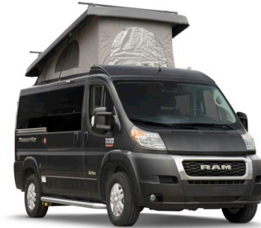
Granite Crystal Metallic