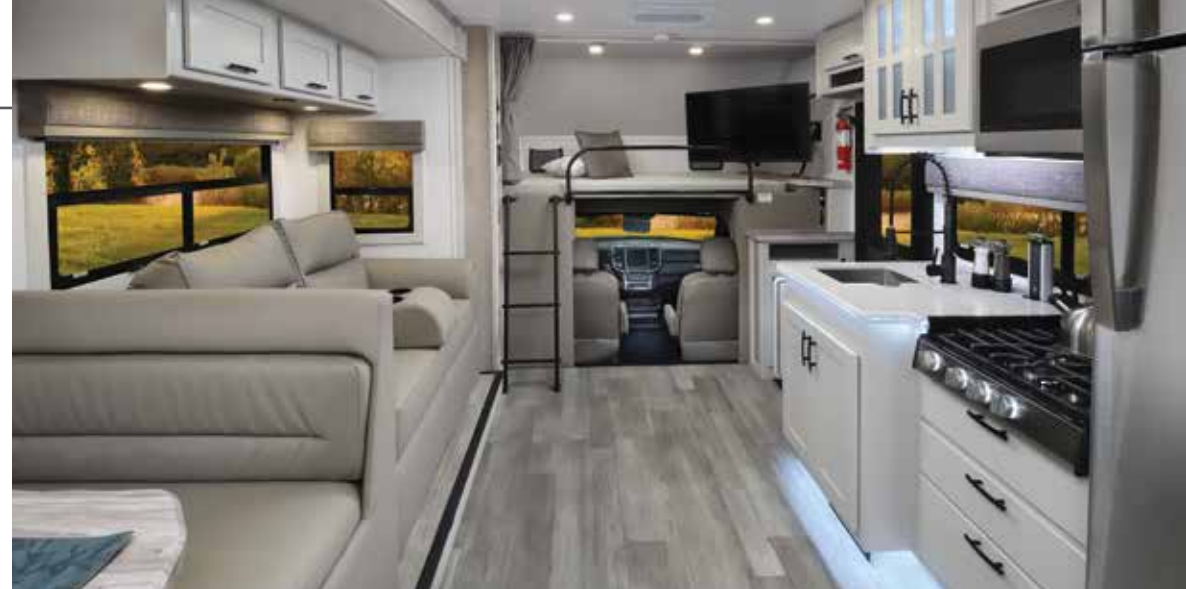
30FW with Gray Mist cabinetry and Milano décor shown with optional power theater seats.