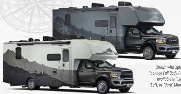
Shown with Xplorer Package Full Body Paint available in "Light" (Left) or "Dark" (Above).