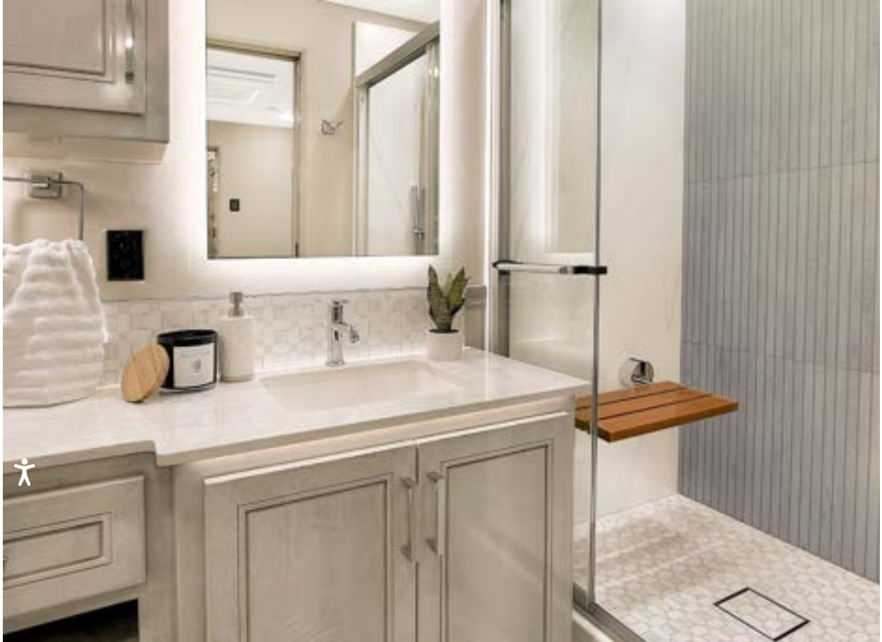
Cape Cod Cabinetry // Haven Interior Décor // The bathroom features a solid surface shower with an accent tile wall, floor inlay, an integrated niche and a sliding glass door.