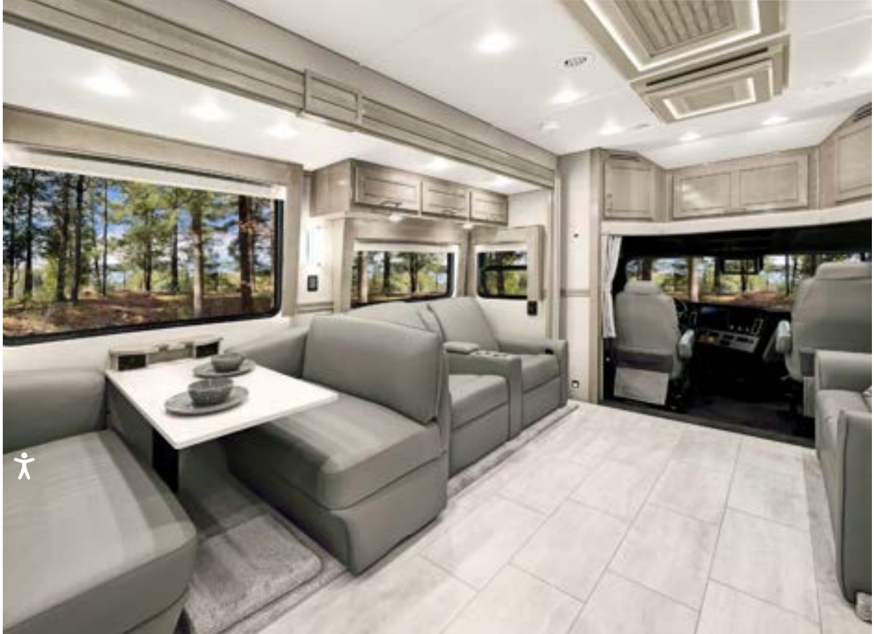
Cape Cod Cabinetry // Haven Interior Décor // Relax in your comfortable Mastrotto® Italian hide leather furniture.