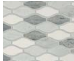
Bathroom Backsplash & Shower Floor