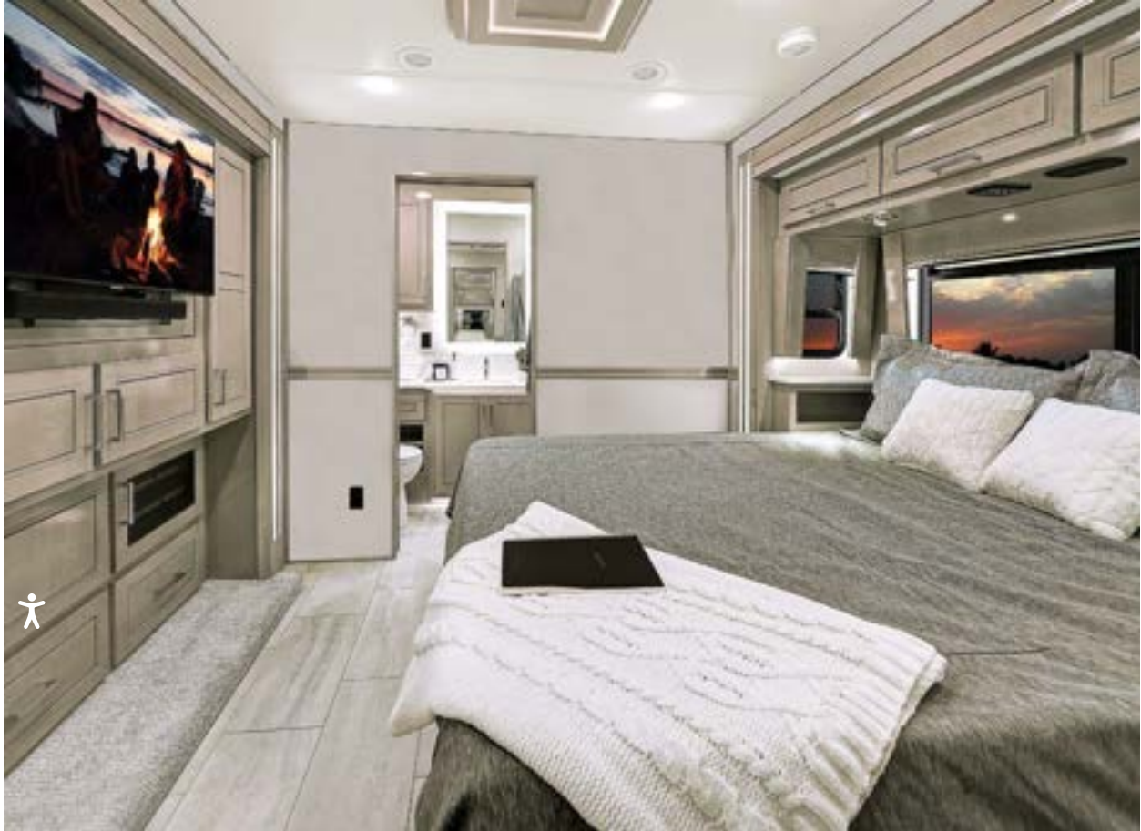
Cape Cod Cabinetry // Haven Interior Décor // The bedroom comes with a memory foam mattress, lots of storage and a 43" 4k Smart LED TV.