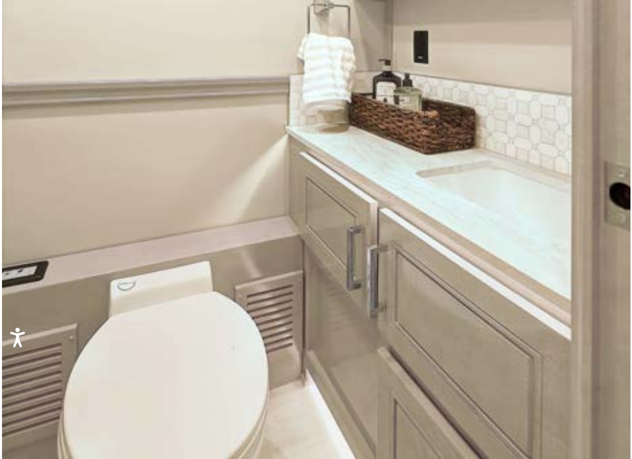
Cape Cod Cabinetry // Haven Interior Décor // The porcelain toilets are macerating with a push button flush.