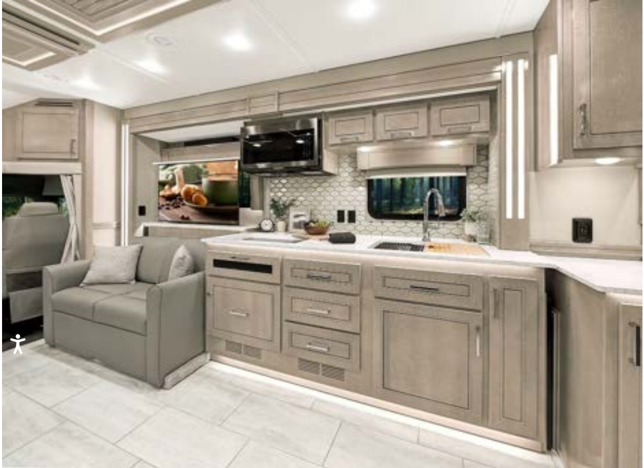
Cape Cod Cabinetry // Haven Interior Décor // Prepare your favorite meals on the road in this functional kitchen.