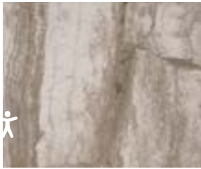
Bernini Camo Matte