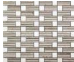
Bathroom Backsplash & Shower Floor