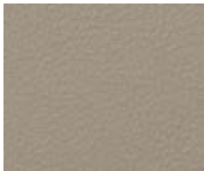
Linea Grigio Perla