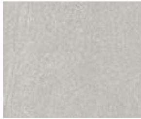
Elegance Pro Naturale Gray