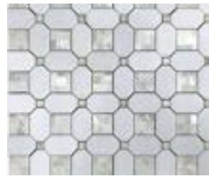
Bathroom Backsplash & Shower Floor