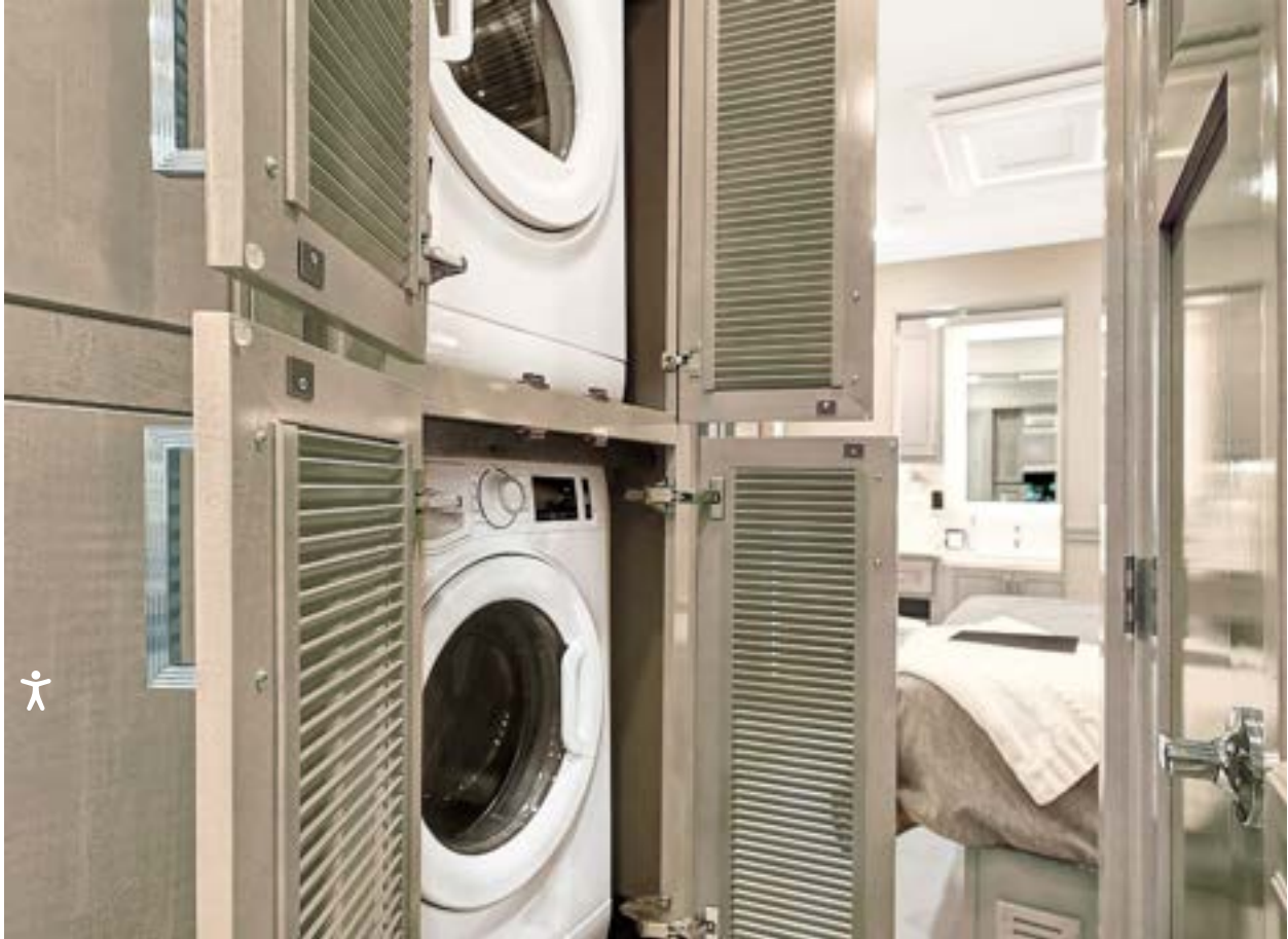
Cape Cod Cabinetry // Haven Interior Décor // The 2025 XL comes pre-wired and plumbed for the optional washer and dryer stack.