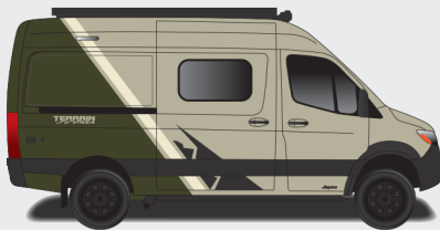
Optional Forest Glade Partial Paint (Sandstone Van Only)