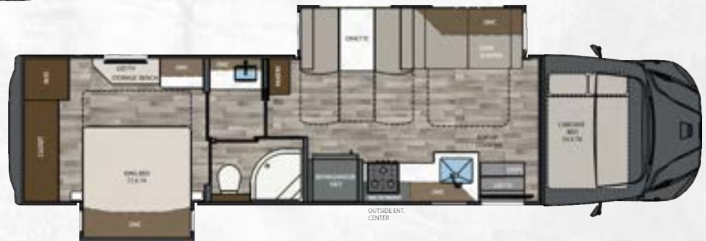
38RW | 38' MID BATH, REAR WARDROBE, 2 SLIDES