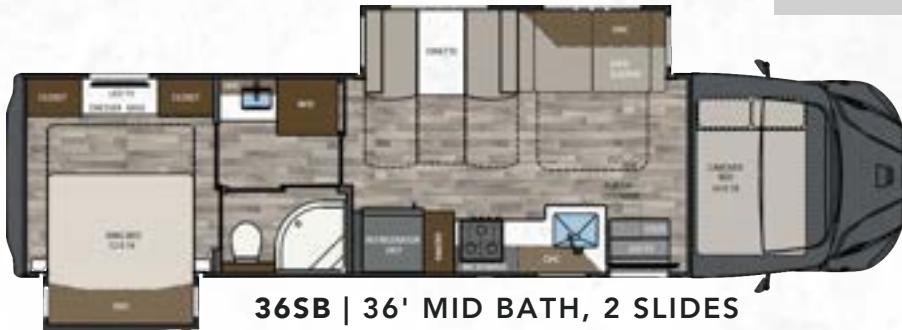
36SB | 36' MID BATH, 2 SLIDES