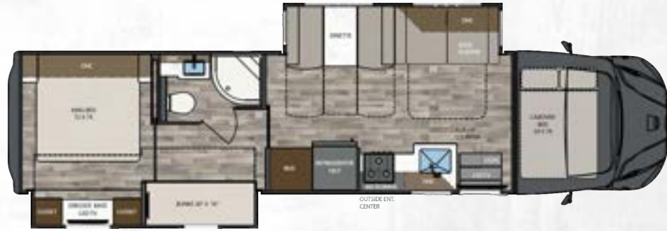
38BB | 38' MID BATH, BUNK BEDS, 2 SLIDES