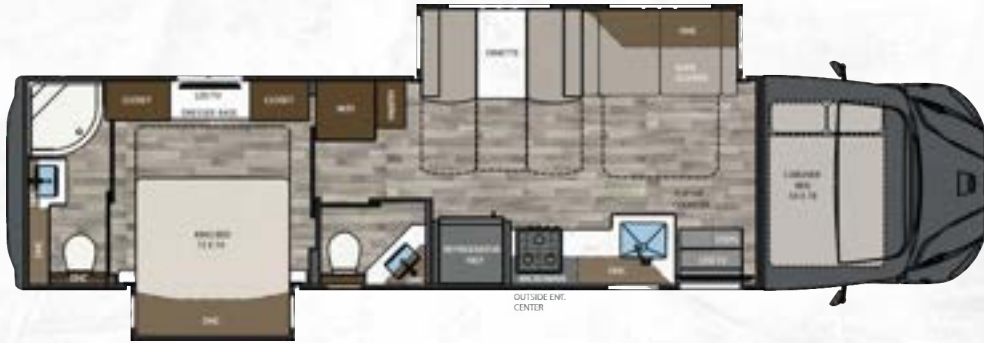
38RB | 38' MID AND REAR BATH, 2 SLIDES