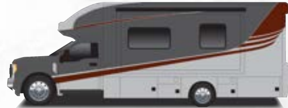
RED ROCK CANYON