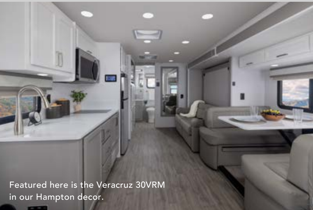
Featured here is the Veracruz 30VRM in our Hampton decor.