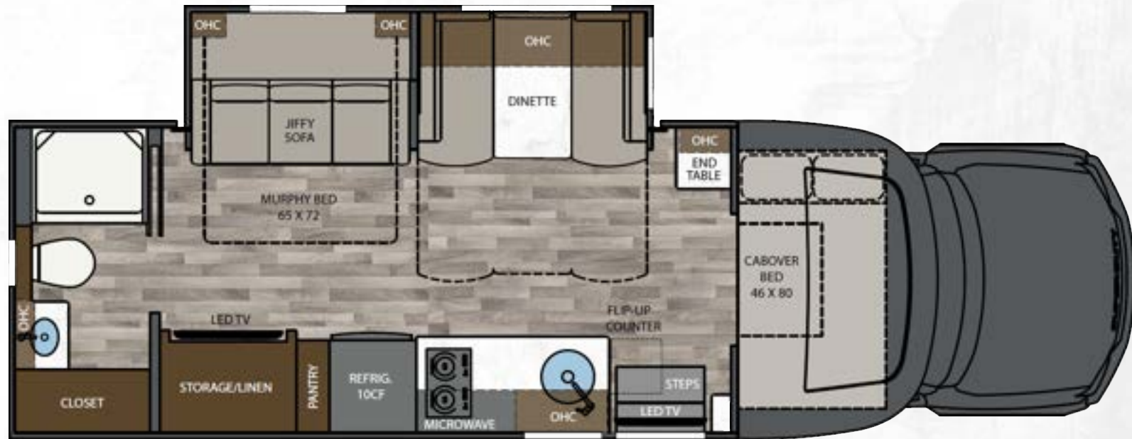
30VRM | 30' FRONT ENTRY, REAR MURPHY BED