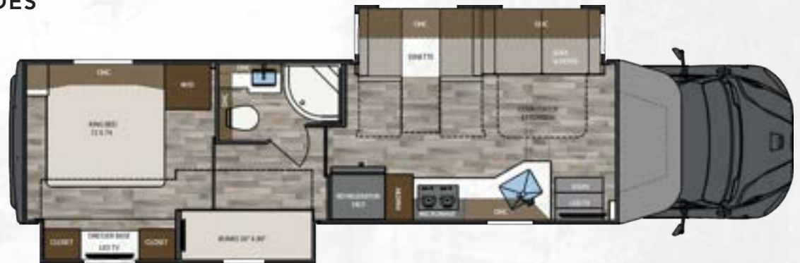
40VBH | 40' MID BATH, BUNK BEDS, 2 SLIDES