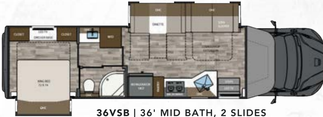
36VSB | 36' MID BATH, 2 SLIDES