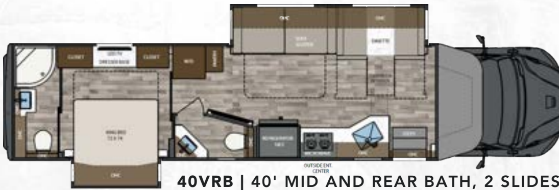
40VRB | 40' MID AND REAR BATH, 2 SLIDES